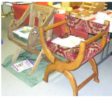
The Gruefenberg Chair & Glastonbury Chair