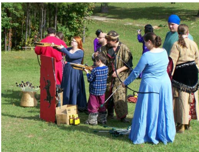
Combat target archery is very popular.